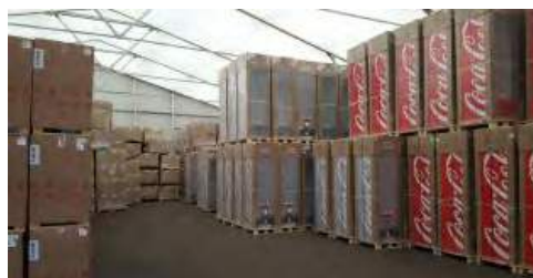
Ideal storage for Bulky Items

No problem, we also offer steel framed permanent buildings. We use the finest grade of galvanised steel and provide a co-ordinated and integrated service that is innovative and cost effective.