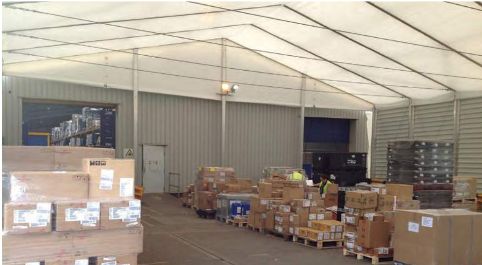
Designed for fork truck and vehicle access

We offer attractive rental rates with the same level of individuality as when you buy. At the end of the rental period, you can decide whether to continue renting the structure, disassemble it or take over ownership.