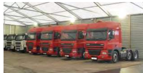
Temporary Warehouse Used to Store Arctic Trailers

So with Instant Space you benefit from a guaranteed cost and the peace of mind that the temporary building installation is safe and performed by experienced operatives.