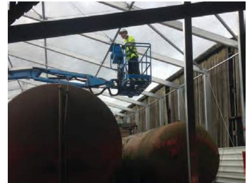
Experienced installation team